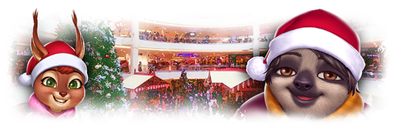
"Shopping Clutter 2: Christmas Square" is an amazing, colorful brain-jogging game for players of all ages with festive images, animation and music for entering the spirit of Christmas.

But it turned out to be not as easy as the Walkers thought, so they have to do a lot and clean up the store shelves' clutter to find all the necessary equipment. Would you like to be one of Santa Claus's elves for a while and help out? Then, join the Walkers!